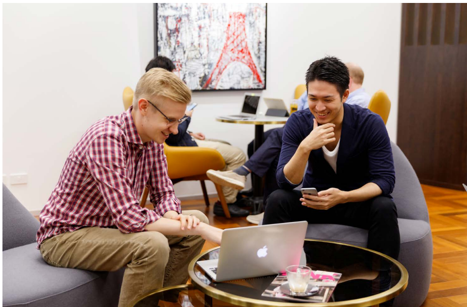
Tri-Seven Roppongi // Tokyo

Your Servcorp Team can arrange for your Servcorp telephone number and business directory listing to be displayed in local telephone and online directories, increasing your business's visibility in the global market.