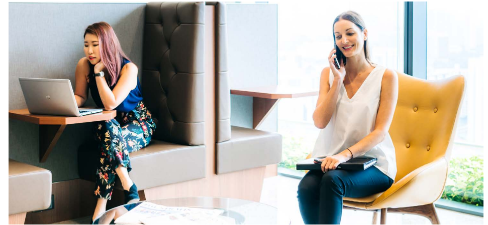
CapitaGreen // Singapore