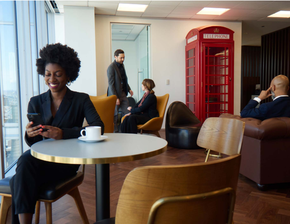
Riverpoint // Chicago